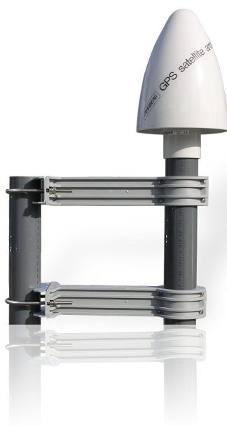
GPS Antenna/Converter Unit with mounting kit

60 cm x 40,5 cm x 27 cm / approx. gross weight per box: 9 kg. (23.6 inch x 15.9 inch x 10.6 inch / approx. gross weight per box: 19.8 pound).